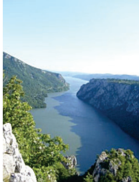
Danube breakthrough, Djerdap National Park Western Carpathians, Serbia

The association of Ökologischer Tourismus in Europa (Ö.T.E.) e.V. (Ecological Tourism in Europe, ETE) has partnered with the NGO network CEEweb for Biodiversity (Budapest, Hungary) and its Sustainable Tourism Working Group (STWG) since the establishment of the Carpathian Convention; and supported consistently the development of the Tourism Protocol and the preparations for the Tourism Strategy.