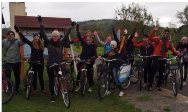
Photo: the second piloting in Austria

Project partners have been busy with their piloting work in every region: